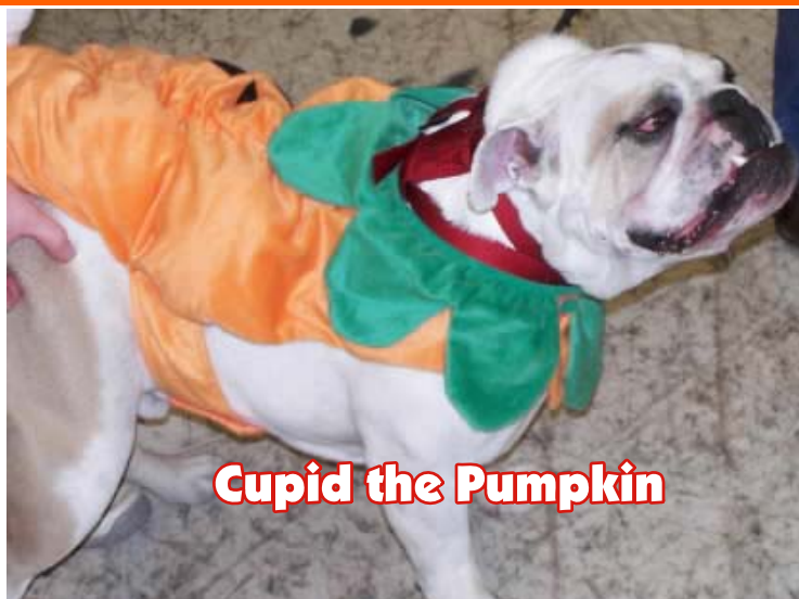
Cupid the Pumpkin