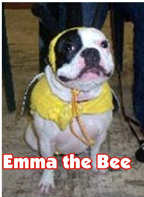
Emma the Bee