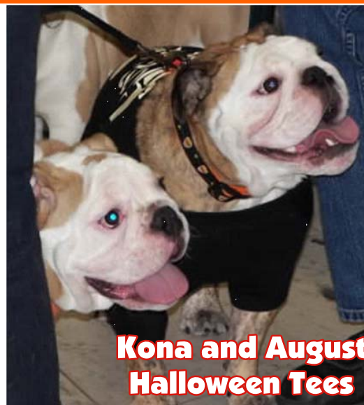
Kona and August Halloween Tees