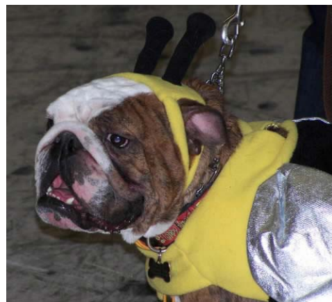
Honorable Mention - Angus the Bee who owns Elysia