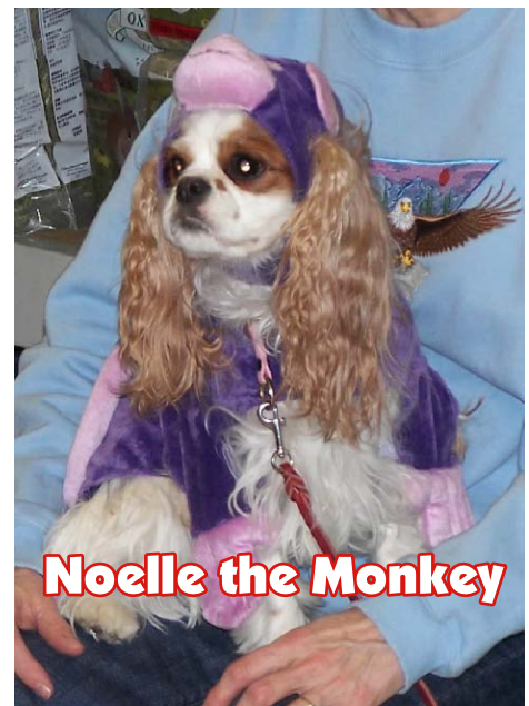
Noelle the Monkey